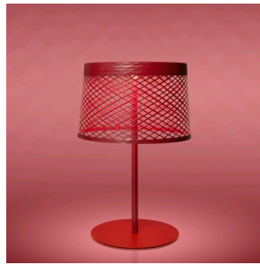
Twigggy Grid XL