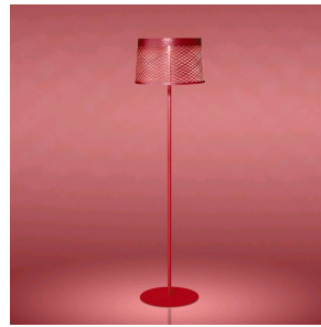
Twigggy Grid Lettura