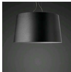
Twice as Twigggy