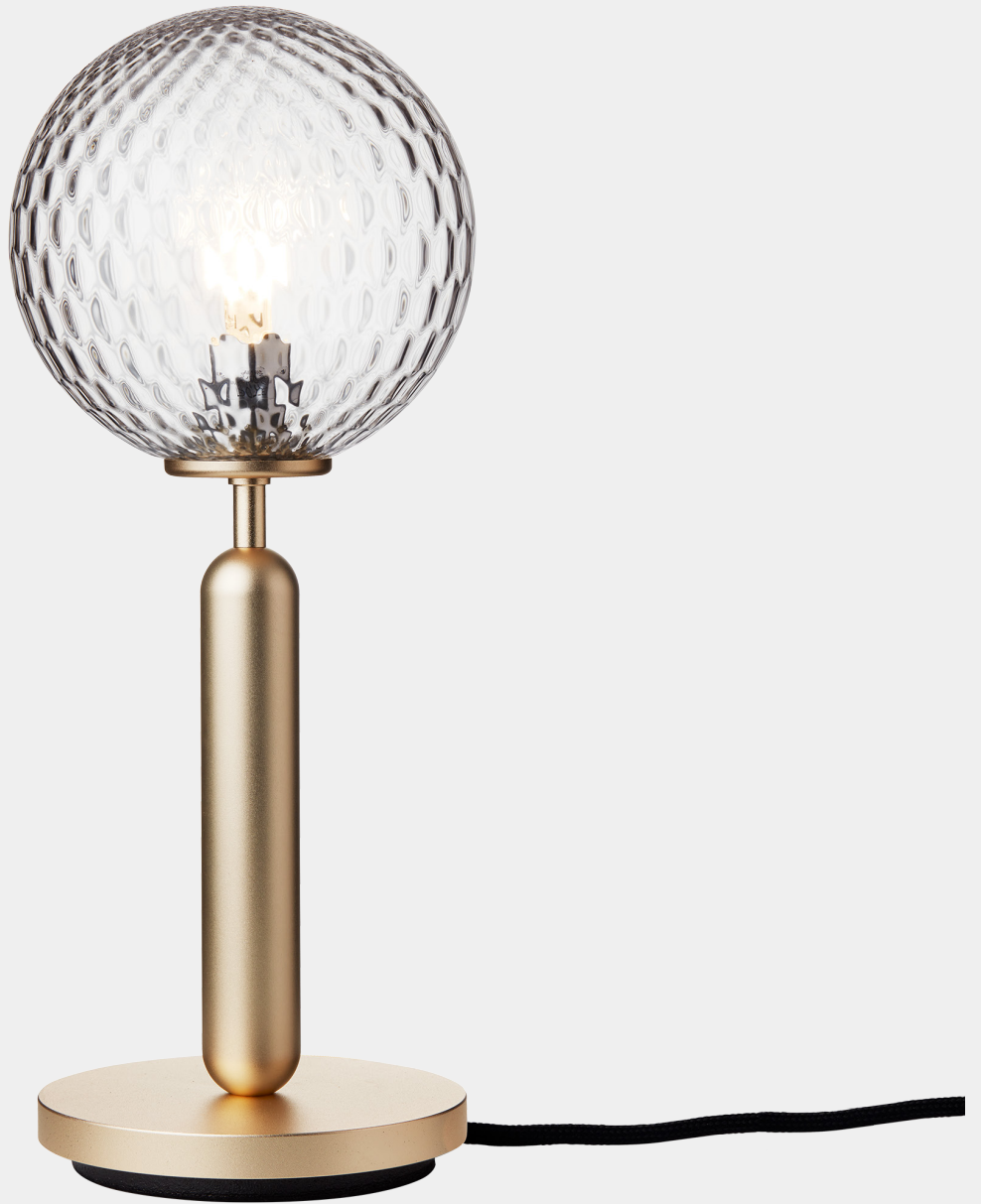
MIIRA TABLE brass / optic clear