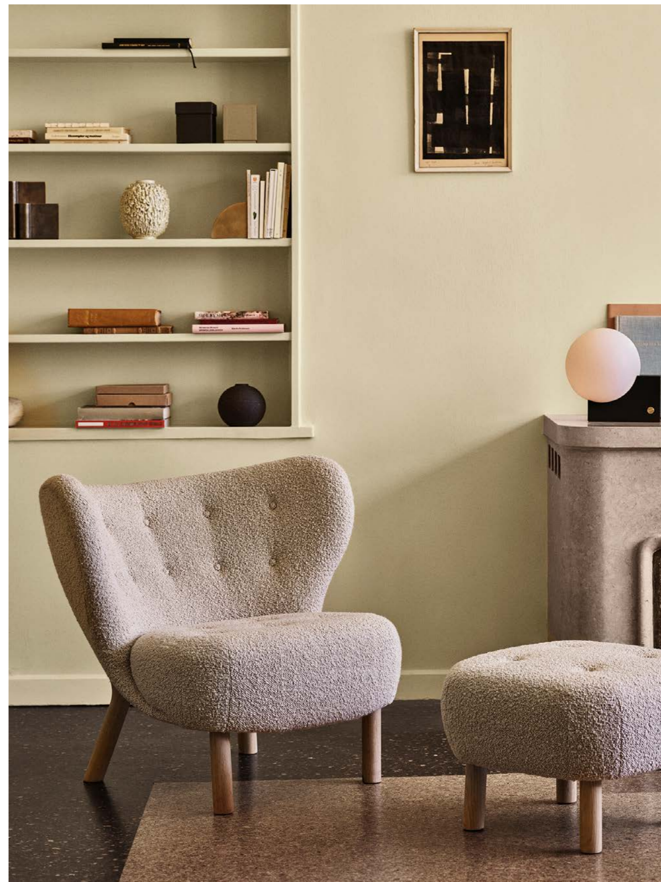
Little Petra VB1 by Viggo Boesen 1938 | Pouf ATD by &Tradition 2020 | Como SC53, Candleholder SC40–41 by Space Copenhagen 2020 Journey SHY1 by Signe Hytte 2018