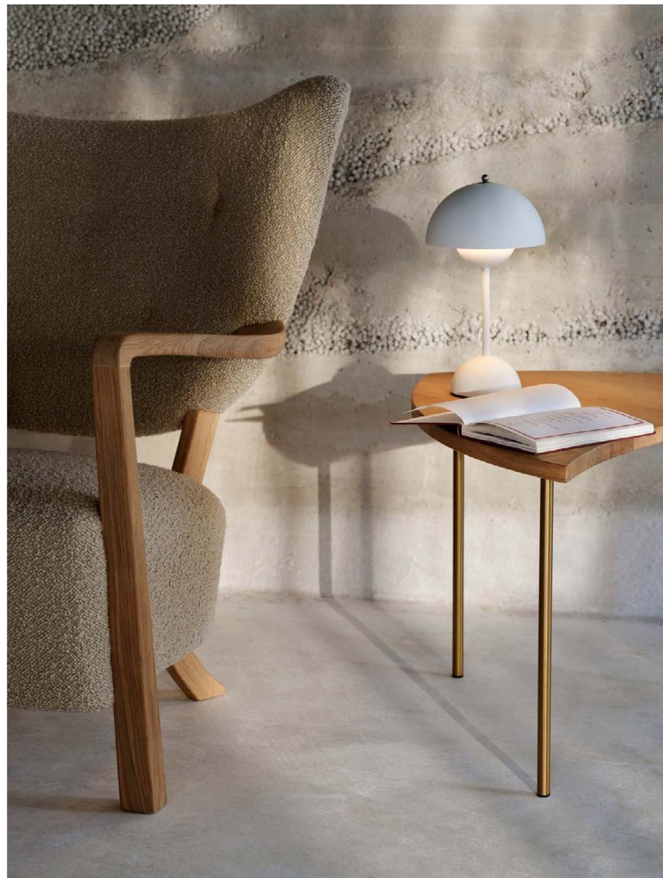
Wulff ATD2 1938 | Pinwheel HM7 by Hvidt & Mølgaard 1953 | Flowerpot VP9 by Verner Panton 1968